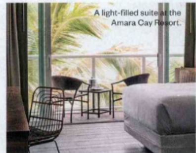
A light-filled suite at the Amara Cay Resort.